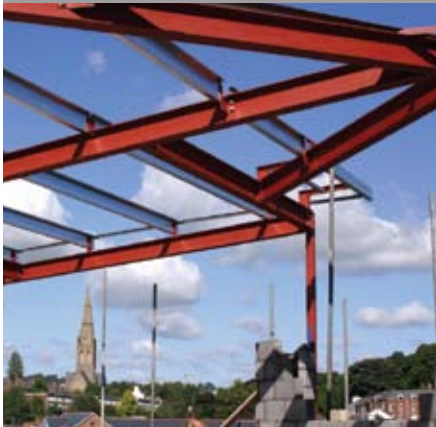
Roof steel work.