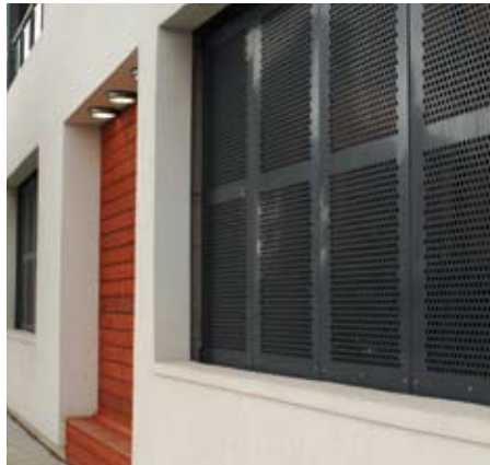
Perforated cladding to carpark voids.