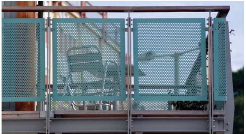
Powder coating in a wide range of colours.