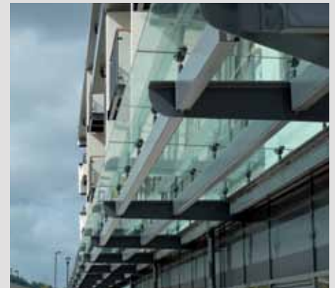
Glazed canopies and balconies. Whittle Square, Barnwood Construction