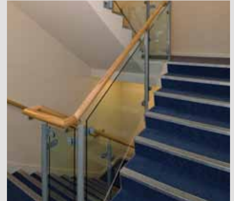
Powder coated balustrade with toughened glass infill panels and hardwood rails. Building 7, Kier Construction