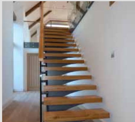
Offset feature stair support with hardwood treads and structural glass balustrade. Fry's Farm Barn, Private Client