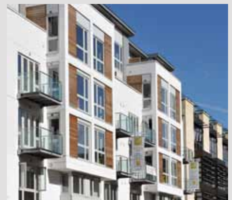
Stainless steel balustrade and handrails with glass infill panels. Cabot House Bristol, Sir Robert McAlpine