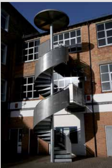
Galvanized spiral staircase with powder coated perforated infill panels. Viney Street, Summerfield Developments