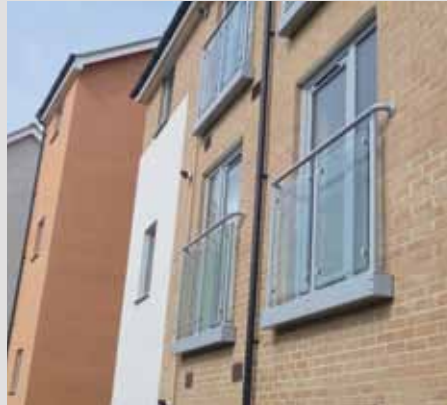
Powder coated Juliette balconies with glass infill panels. Portland Green, Persimmon Homes

We understand that the residential sector is driven by sales, and this often requires a flexible and adaptable approach to meet changing completion dates.