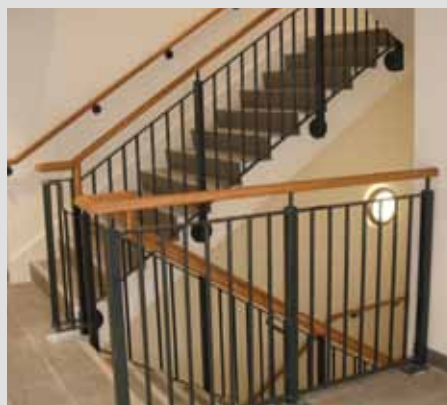
Bar infill powder coated balustrade with hardwood handrails. Southgate, Sir Robert McAlpine