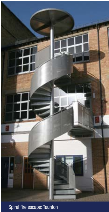
Spiral fire escape: Taunton