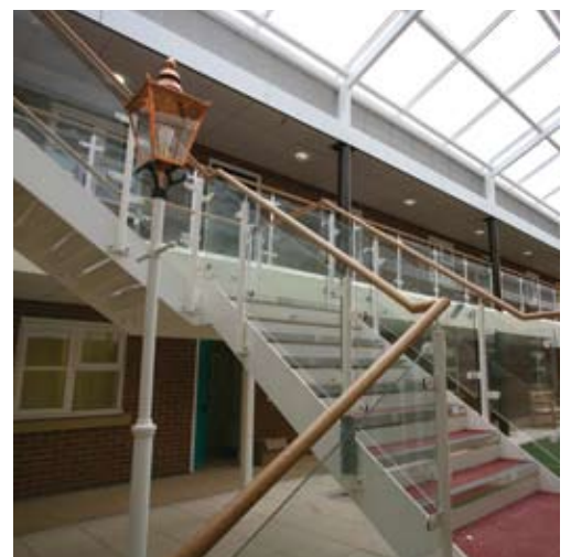
Glass balustrade with timber handrails: Sandford Care Village

Over the last six months Taunton Fabrications have been asked to help out Main Contractors who have experienced some, or all, of the following problems when using other sub-contractors: