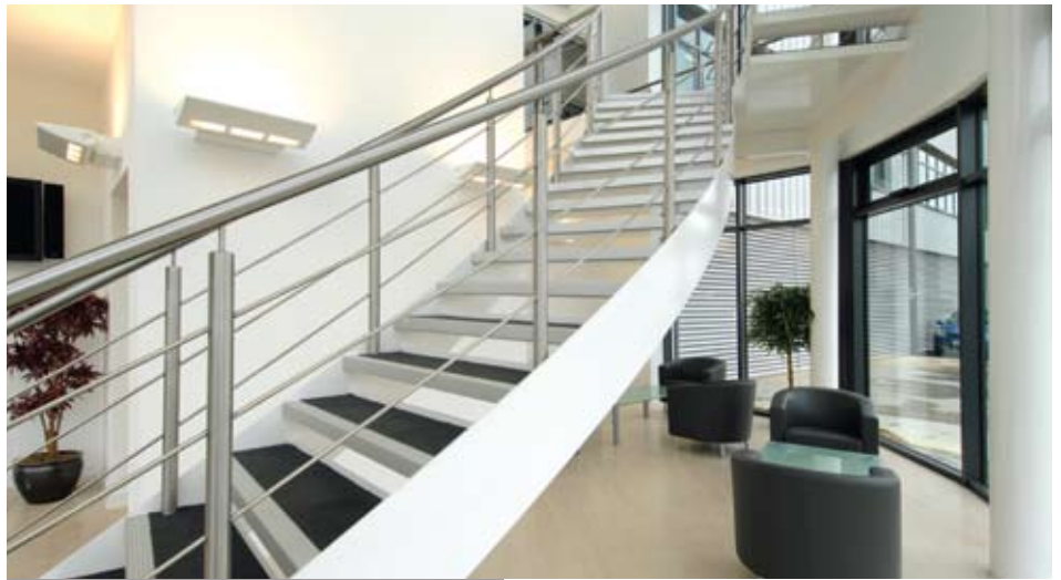
Flat string powder coated finish with stainless steel balustrade.