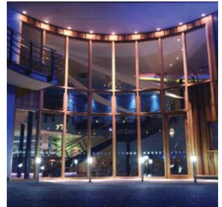
Helical stairs forming the main focal point of this nightclub.