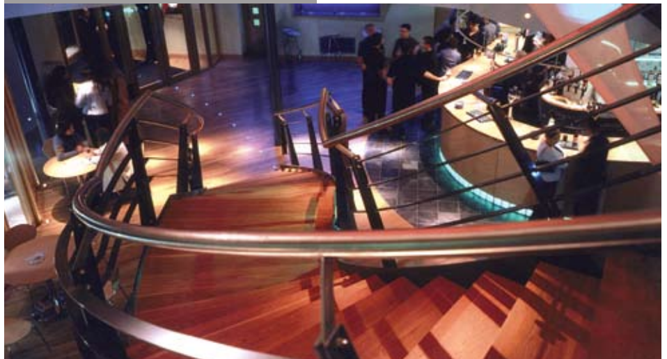
Flat string with timber treads and stainless steel handrails.

Taunton Fabrications STEEL FABRICATION • ARCHITECTURAL METALWORK