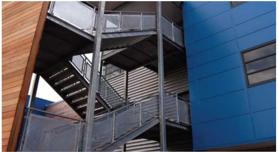
Galvanized structure with column support system and disabled refuge areas.