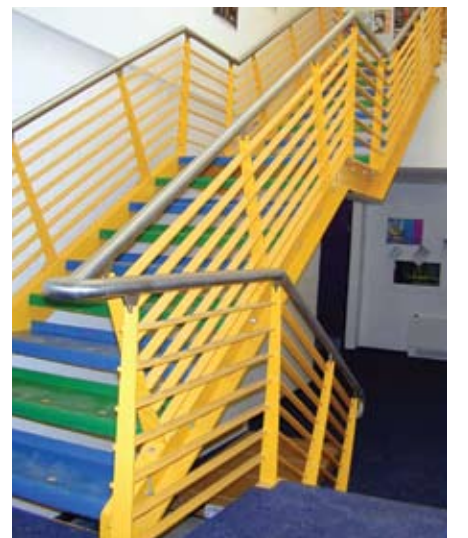
Powder coated structure and balustrade.